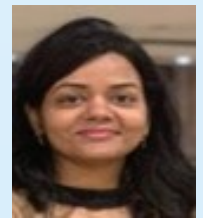
Jt. Org. Secretary