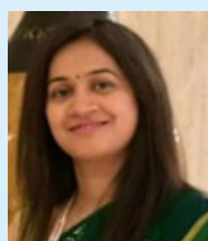
Jt. Org. Secretary